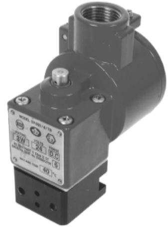
Valve is illustrated with a EExd Flameproof Coil