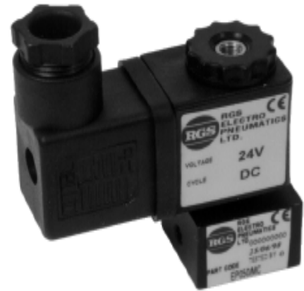
Valve is illustrated with a Mini Plug & Socket Coil