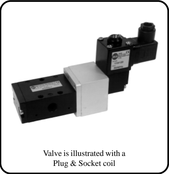
Valve is illustrated with a Plug & Socket coil